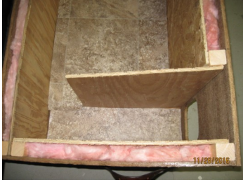
A view of the interior of the Alley Cat winter cat shelter plan displaying double insulated walls, insulation under vinyl flooring and wind guard. Interior will be filled with straw.

Every year, the Community Cats TNR newsletter stresses the need for winter cat shelters! Winter is brutal for homeless cats. They need help throughout the winter months to find shelter that provides them protection from cold and wet weather. Without a good shelter, cats may become ill, and may suffer from frostbite on their ears, nose and paws.