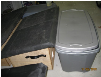
A view of one finished Alley Cat shelter with rubber roof next to large totes of similar size ready to be constructed.

Visit www.alleycat.org or www.bestfriends.org , or www.neighborhoodcats.org and www.communitycatstnr.org for ideas and information on how to build shelters. Community Cats TNR volunteers have built numerous Alley Cat shelters during the past twelve years. Donations of 1/2" exterior plywood, luan or paneling, insulation board and fiberglass insulation, exterior latex paint in a "camouflage color," 50 and 30 gallon storage bins and insulated coolers are needed.